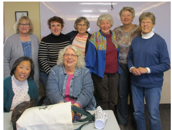
A fun time at Soup & Sew