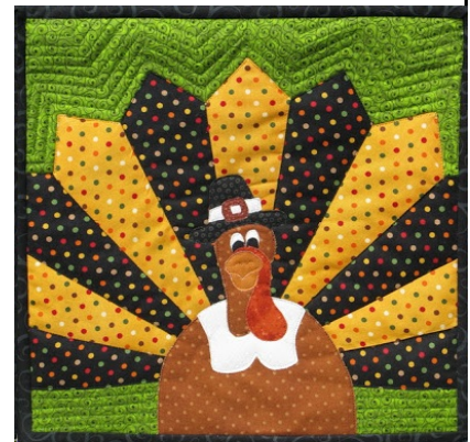
Free Turkey block pattern