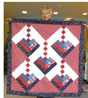
And one for the new grand-baby